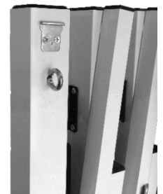
Pod mount & Tether Eyelet

Notes: (1) Batteries Purchased Separately - 1-3 batteries can be installed in the base. (2) MSS units can be purchased with 1 or 3 panels installed, not field changeable/upgradeable